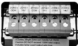
Angled terminal block