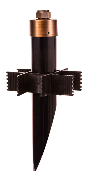
Page 1 of 1